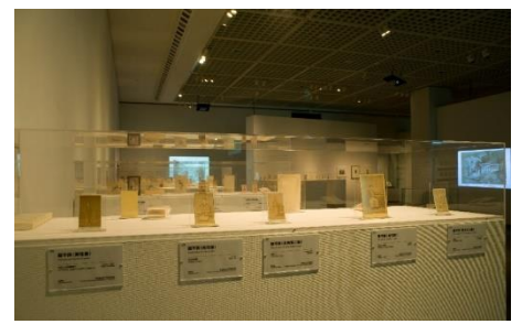
View of the 2011 exhibition "The Dawn of Japanese Photography: Shikoku,, Kyushu and Okinawa."

April 13 from 4 pm April 14 from 6 pm (guide is Japan Times writer Alice Gordenker)